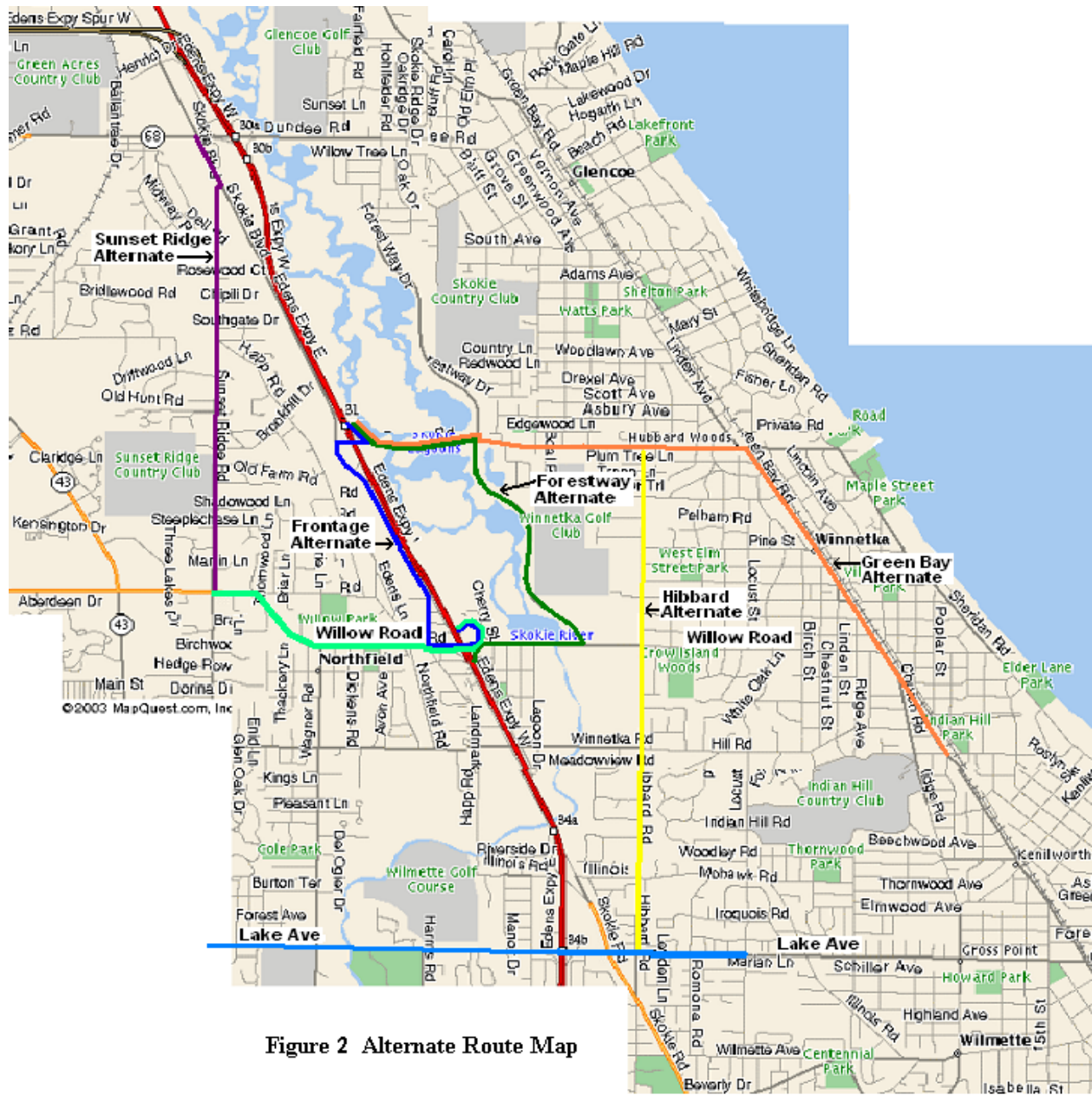
Figure 2 Alternate Route Map